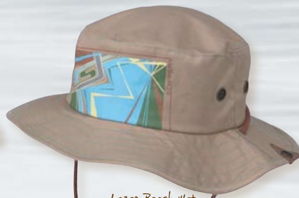
Lazer Beach Hat SAND 3070-0170