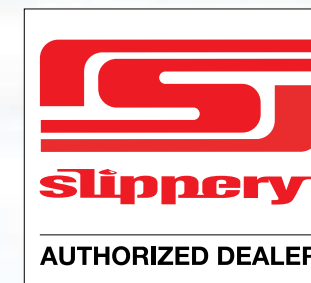
Window Decal DECAL 4320-0669