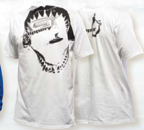
Predator Tee 100% brushed cotton tee with screen print