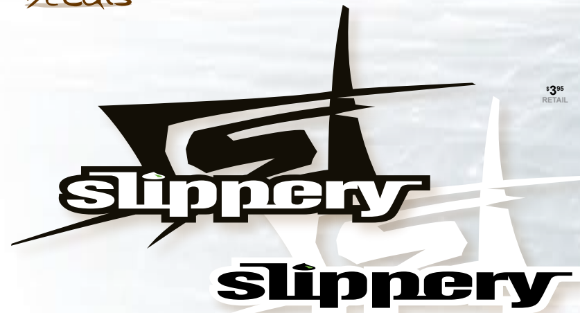
Logo Sticker 6" $3.95 RETAIL 2-PACK 4320-0623