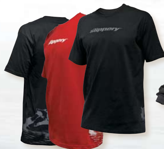
Slippery Tee 100% brushed cotton tee with screen print