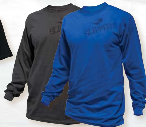
Slider LS Tee 100% brushed cotton tee with screen print