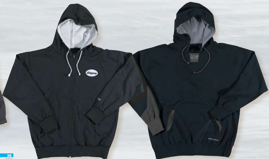
Frayed Hoody 80% Cotton / 20% Polyester Zip-up