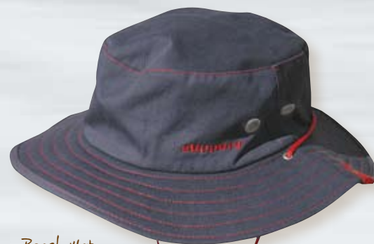
Beach Hat GREY 2501-0419