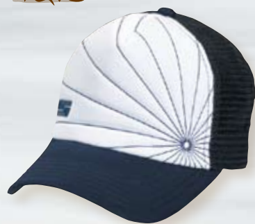
Panic Trucker Hat NAVY 3070-0001