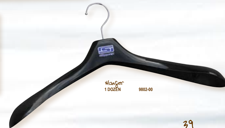
Hanger 1 DOZEN 9802-00