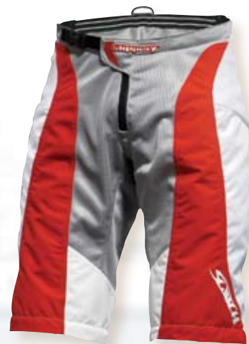
Removable legs transform pants into shorts