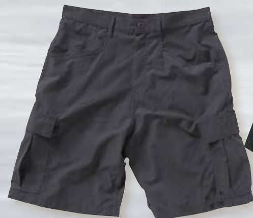
Toro Shorts 3.8 oz. quick-dry micro-fiber