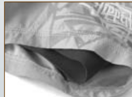
Neoprene inner liner for added warmth