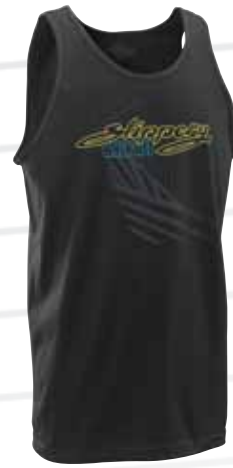
Throwback Tank $19 95 M L XL XXL BLACK 3030- 4242 4243 4244 4245