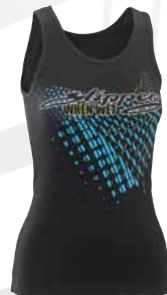
Shenade Girl's Tank $21 95 S M L XL BLACK 3031- 1226 1227 1228 1229