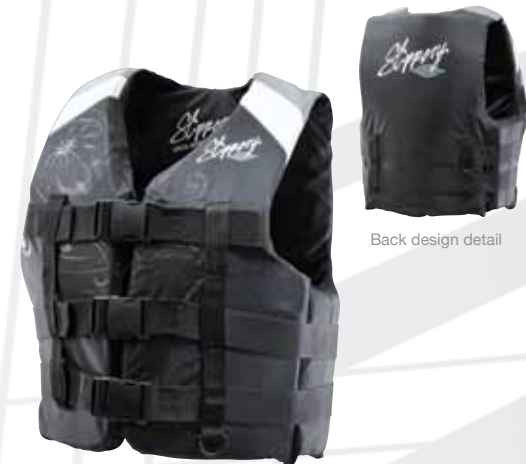
Back design detail