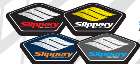
Slippery Decal 4 PACK 4320-0804 $5 95