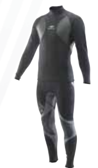
Reform Jacket over Reform John