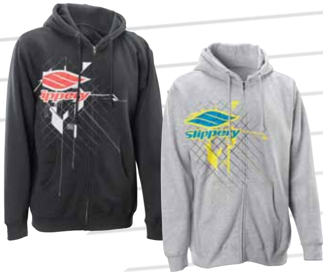
Circuit Zip-Up Hoody $44 95 M L XL XXL BLACK 3050- 0951 0952 0953 0954 GRAY 3050- 0955 0956 0957 0958