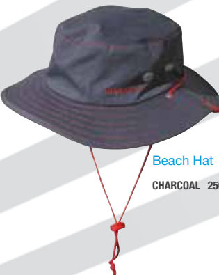
Beach Hat $21 95 OSFA CHARCOAL 2501- 0420