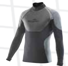
The matrix suit comes with a jacket that can be worn separately or together.