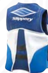
Back design detail

XS S M L XL XXL XXXL BLUE 3240- 0316 0317 0318 0319 0320 0321 0362