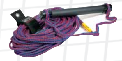
STANDARD ROPE 4808-0002 $16 95