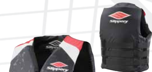
Back design detail