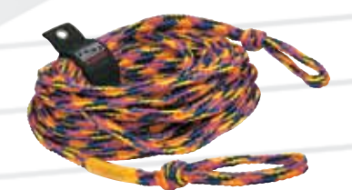
INFLATABLE ROPE 4808-0003 $19 95