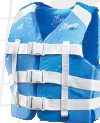
BLUE 3241- | XS S M L 0065 0066 0067 0068