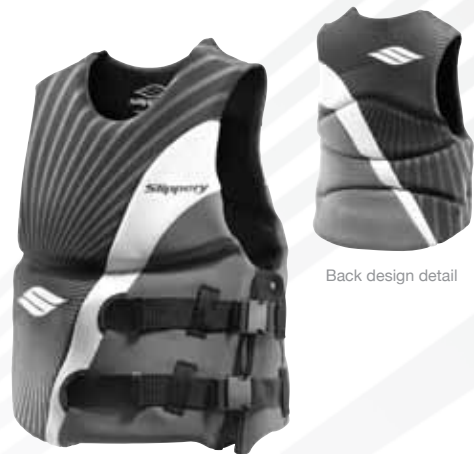
Back design detail

S M L XL XXL BLACK 3240- 0345 0346 0347 0348 0349