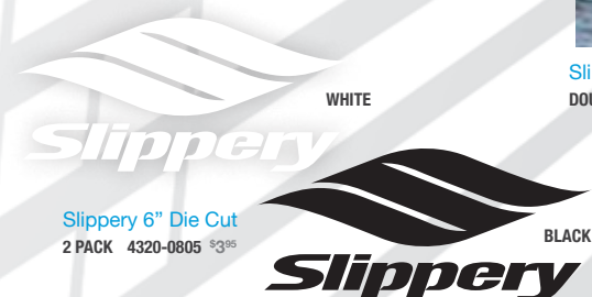
Slippery 6" Die Cut 2 PACK 4320-0805 $3 95