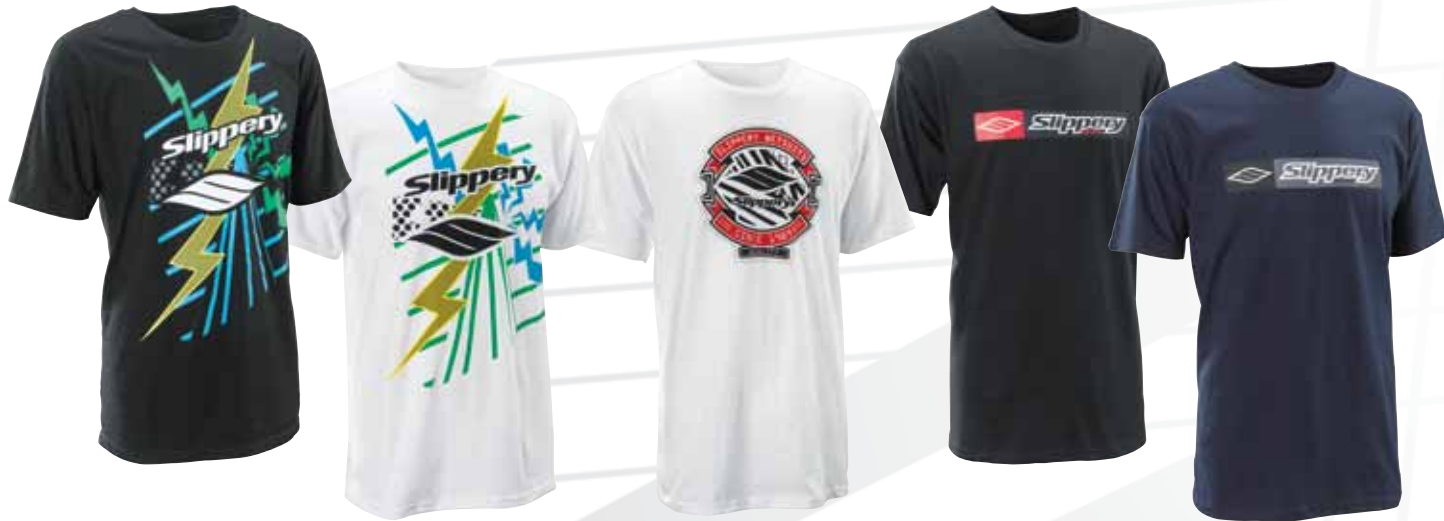
Valor Tee $19 95 M L XL XXL BLACK 3030- 4234 4235 4236 4237 WHITE 3030- 4238 4239 4240 4241