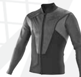
The shogun suit comes with a jacket that can be worn separately or together.