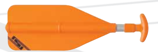
PADDLE 4850-0013 $21 95