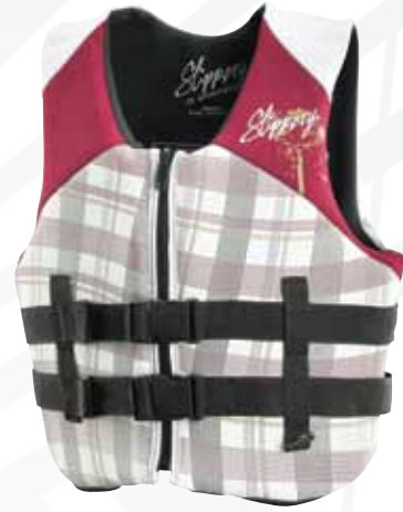
BURGUNDY CHARM 3241- | XS S M L 0074 0075 0076 0078