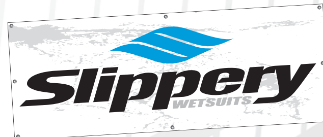
Slippery Banner - 3' x 8' WHITE 9901-0602 $39 95