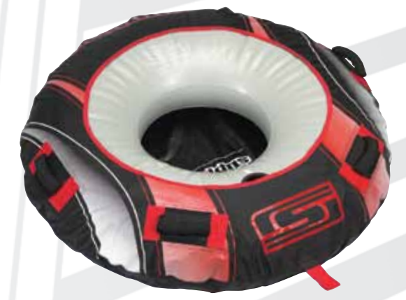
RED/BLACK 4808-0004 $79 95 INNER TUBE 4808-0005 $28 95