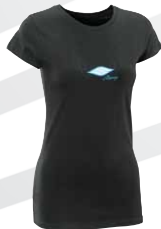
Guardian Women's Tee $19 95 S M L XL BLACK 3031- 1222 1223 1224 1225