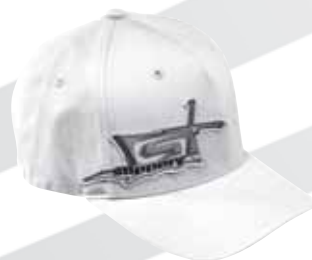
Hat $19 95 OSFA GRAY 2501- 0419