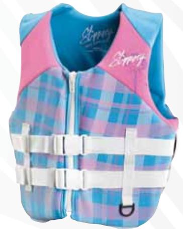
BLUE CHARM 3241- | XS S M L 0069 0070 0071 0073