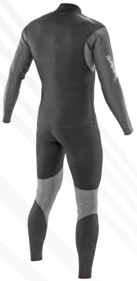
Back design detail

BLACK 3201- | S 0150 | M 0151 | L 0152 | XL 0153 | XXL 0154 | XXXL 0155