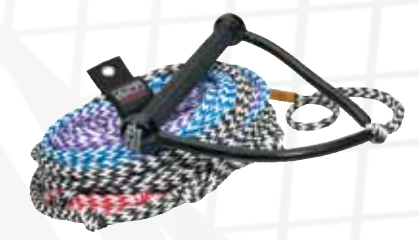
4 SECTION ROPE 4808-0001 $27 95